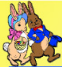
PMPSS Bunnies - The Bad Bunny, Brokeback bunny, Sleepy Bunny and Playboy Bunny