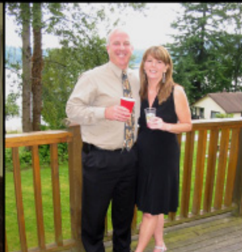
And the winner of this year's bent prop is.....