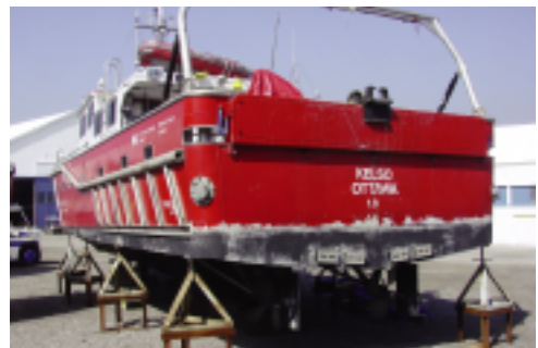
Fisheries vessel Kelso being readied for spring launch.