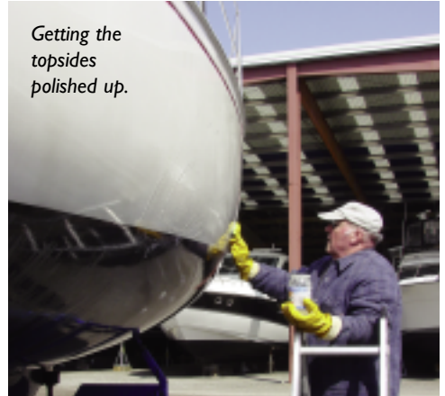
Getting the topsides polished up.