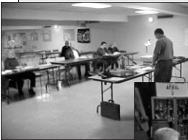
Hamilton Power & Sail Squadron safe boating classes.

VHF, GPS and Boat Pro spring class dates to follow.