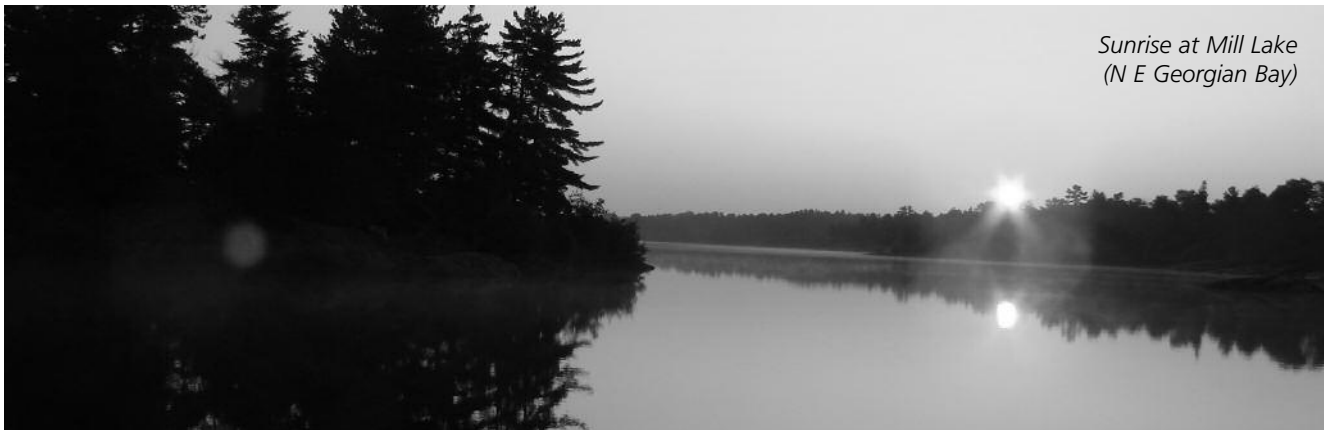
Sunrise at Mill Lake (N E Georgian Bay)

Contact Aviva Traders at 1-877-787-7021 or visit www.avivatraders.com/cps .