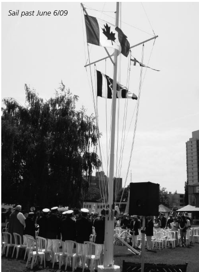
Sail past June 6/09