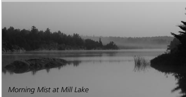
Morning Mist at Mill Lake

Go to the following website www.cps-ecp.ca Login and click on Member Services- then click on Member Benefits.