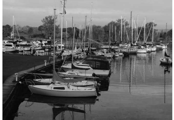
Looking toward Pier 4 Park from the verandah in the morning at MBYC

Vicky Grimshaw 905-628-0645 or e-mail cici@nas.net