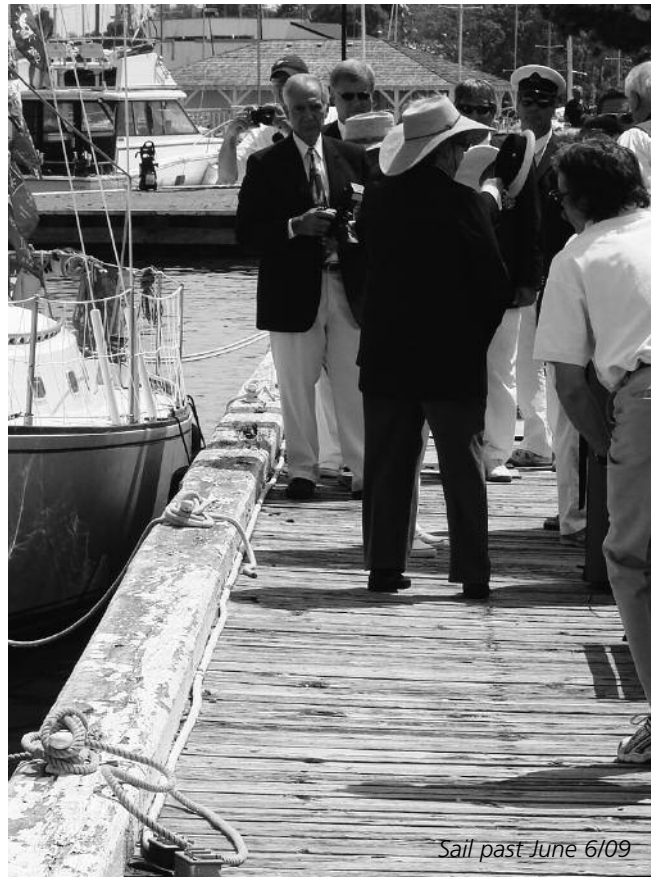
Sail past June 6/09