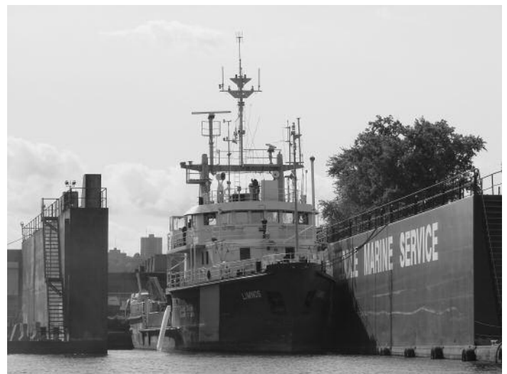
CCG Limnos awaiting maintenance at Heddle Marine