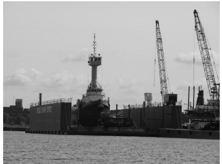
A McKiel tug undergoing inspection in Dry Dock at Heddle Marine