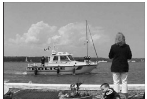
The Hamilton/Halton police boat receiving the salute at the RHYC Sail Past.