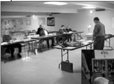
Hamilton Power & Sail Squadron safe boating classes.

VHF, GPS and Boat Pro spring class dates to follow.