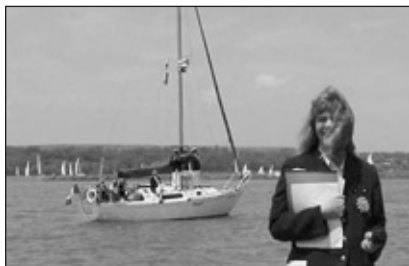
A windy day at the RHYC Sail Past