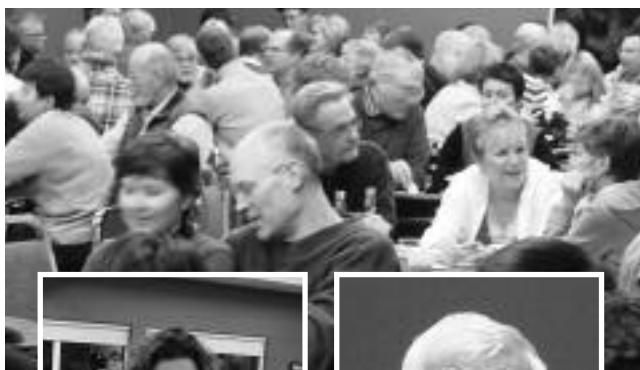
Below: Pizza Night & Great Lakes Presentation