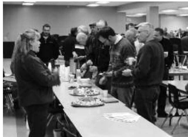
Above: Cider Night with Winter Students