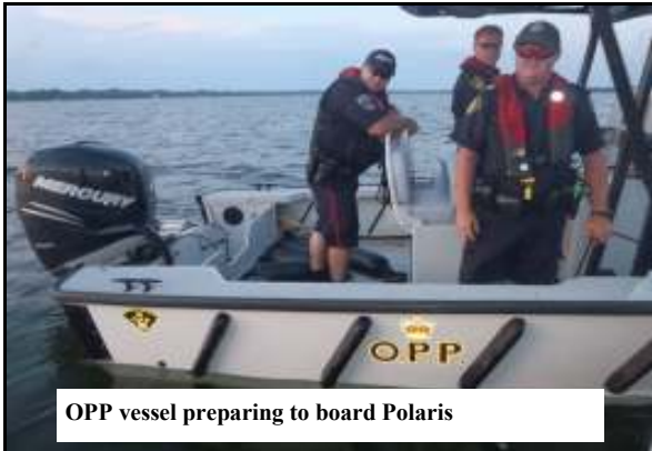
OPP vessel preparing to board Polaris

At approximately 1515 on Wednesday August 08, the CFB Trenton Yacht Club sail race committee boat, Polaris, had lowered the flag and just completed hoisting anchor. The crew was making ready and I was on the stern bench doing time calculations. I turned my head and noticed an OPP Marine Unit boat (see photograph for details) advancing toward our vessel, totally unnoticed by the racing committee crew. I advised the crew to prepare to be boarded.