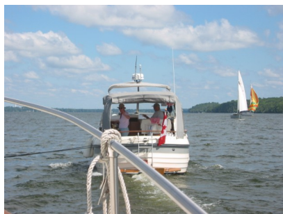
Boaters Helping Boaters